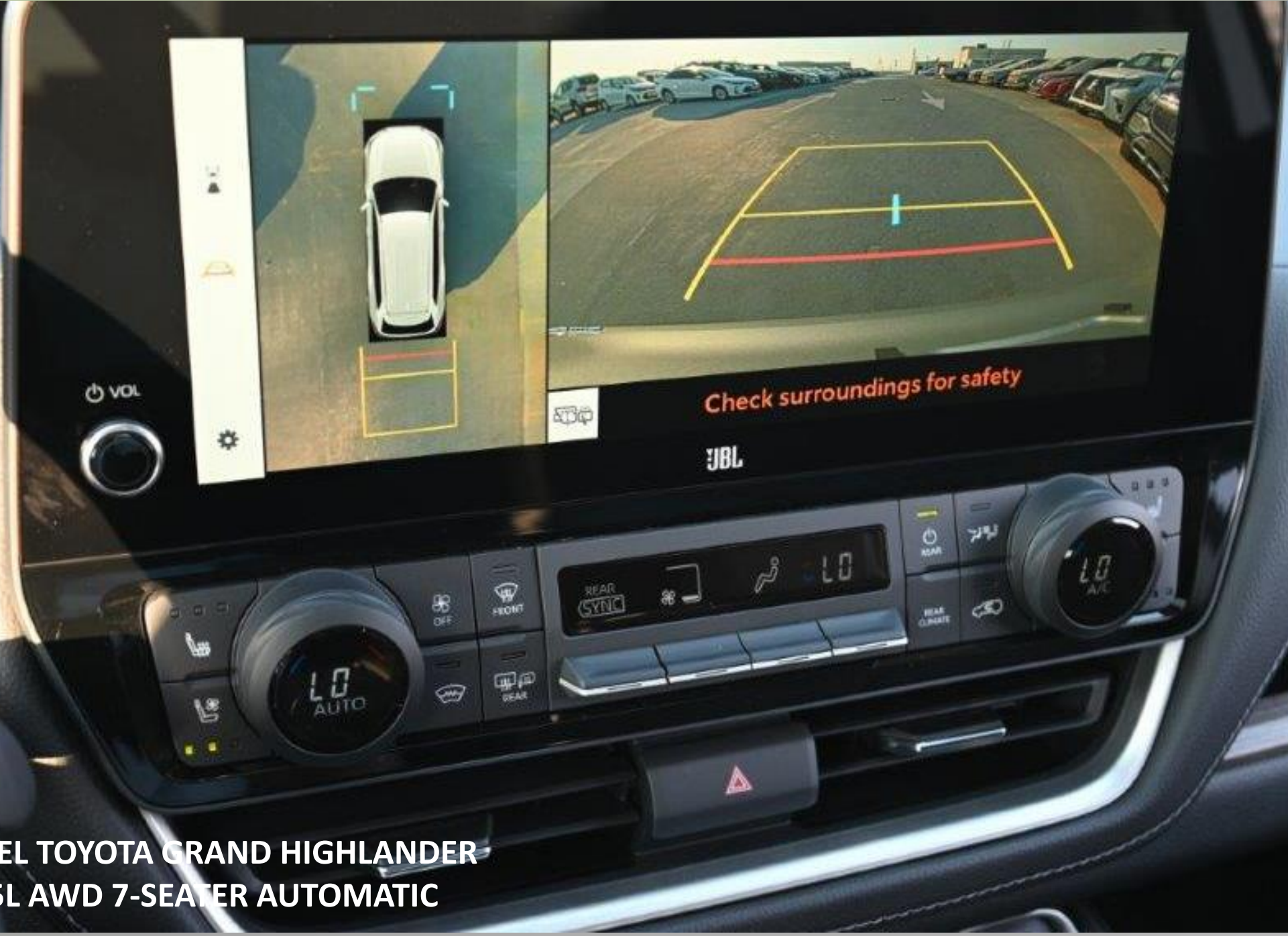
2024 MODEL TOYOTA GRAND HIGHLANDER HYBRID 2.5L AWD 7-SEATER AUTOMATIC