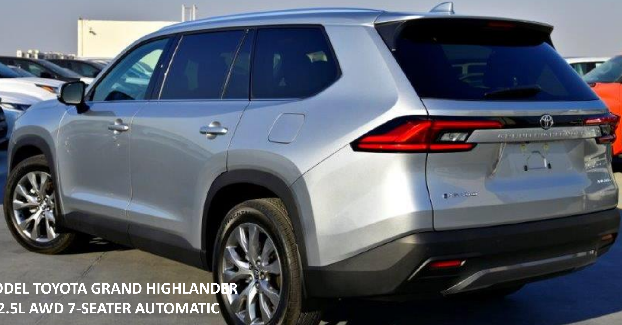
2024 MODEL TOYOTA GRAND HIGHLANDER HYBRID 2.5L AWD 7-SEATER AUTOMATIC