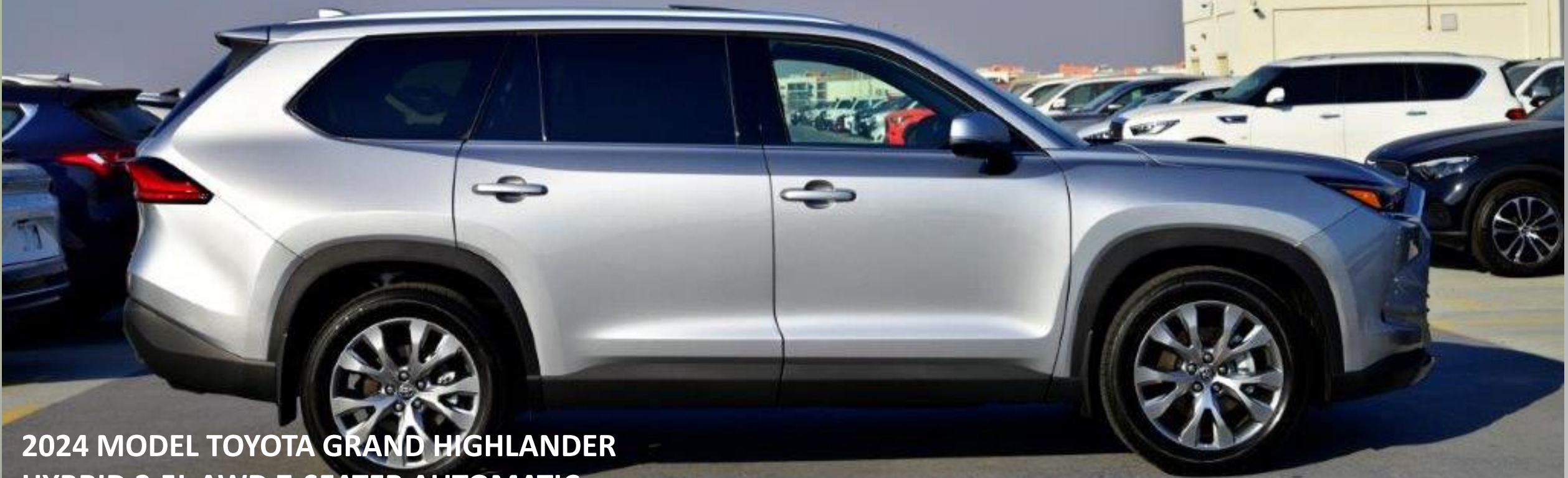
2024 MODEL TOYOTA GRAND HIGHLANDER HYBRID 2.5L AWD 7-SEATER AUTOMATIC