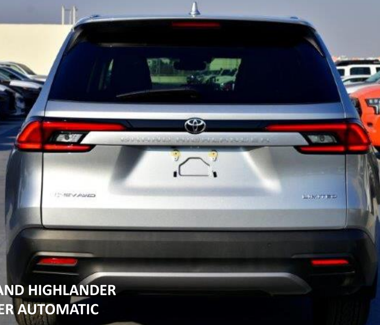
2024 MODEL TOYOTA GRAND HIGHLANDER HYBRID 2.5L AWD 7-SEATER AUTOMATIC