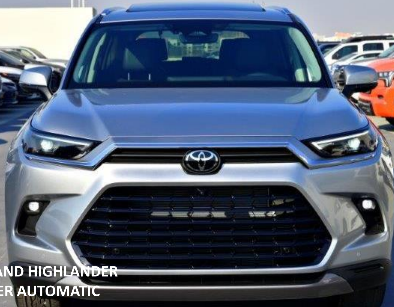
2024 MODEL TOYOTA GRAND HIGHLANDER HYBRID 2.5L AWD 7-SEATER AUTOMATIC