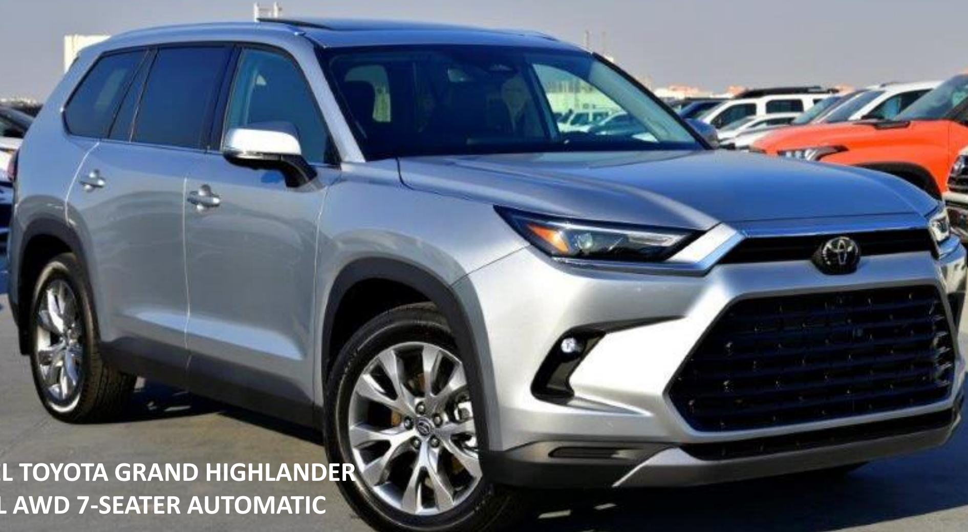
2024 MODEL TOYOTA GRAND HIGHLANDER HYBRID 2.5L AWD 7-SEATER AUTOMATIC